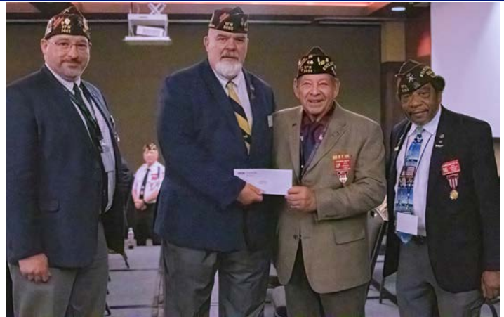
Category 2: Roscoe Post 2955, District 6