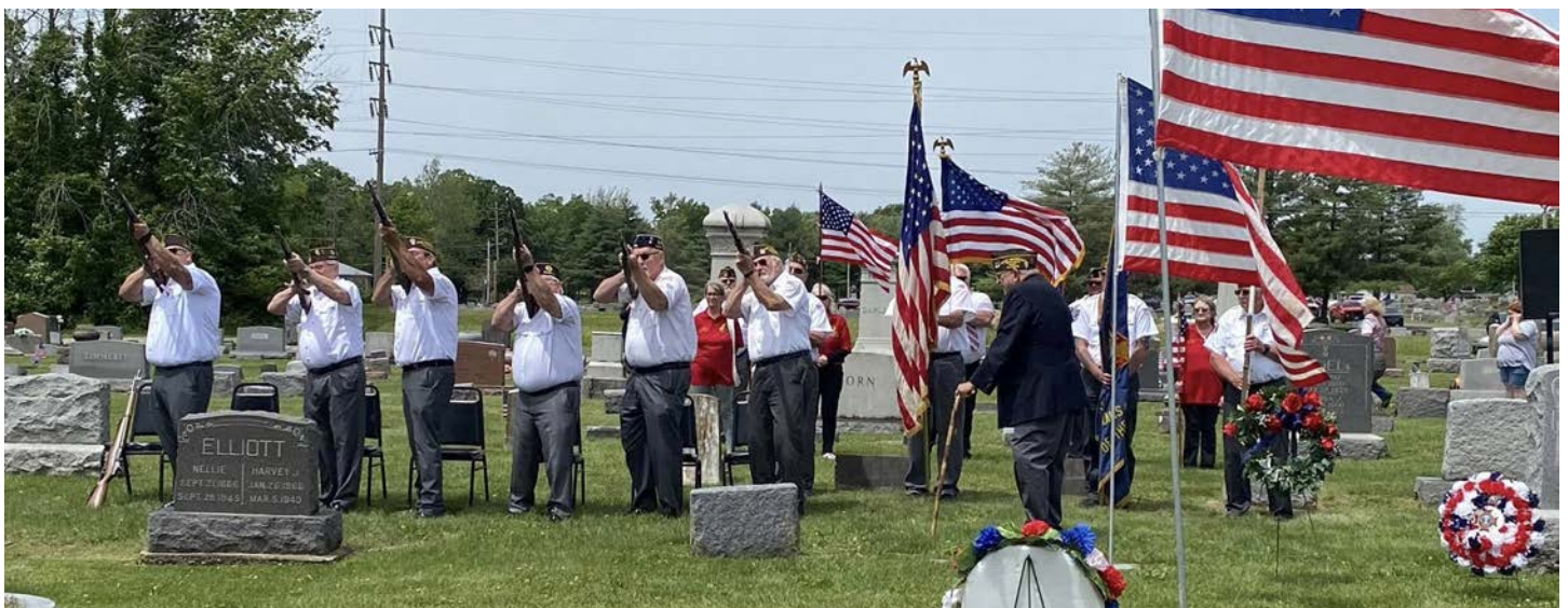
The rifle team fires the first of three volleys to honor departed veterans.