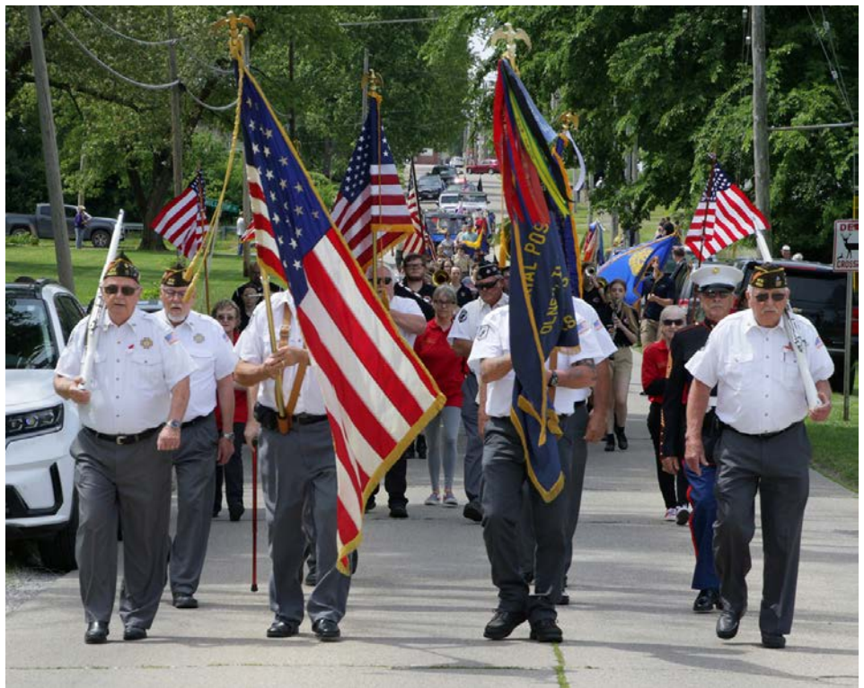
The VFW Color Guard leads the Memorial Day procession.