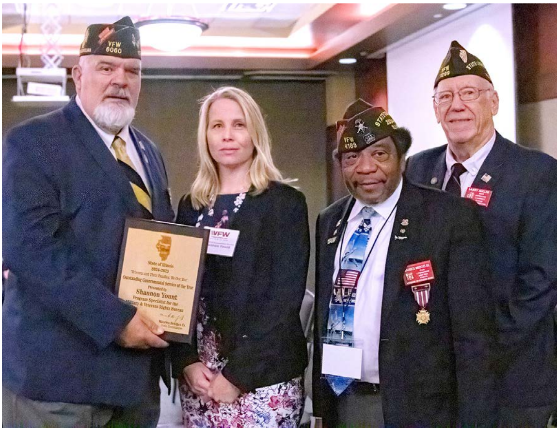
The Outstanding Governmental Service Award recipient is the Program Specialist for the Illinois Attorney General's Military and Veterans Rights Bureau.