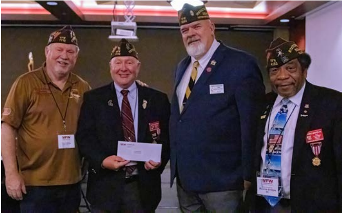
Category 1: New Athens Post 7710, District 14