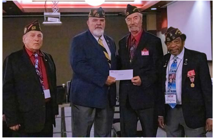
$100 check to District 15 for having the highest number of Patriot's Pen participants