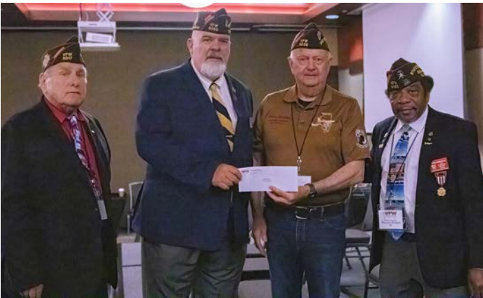
Category 1: Lemont 22 Honor Post 5819, District 19