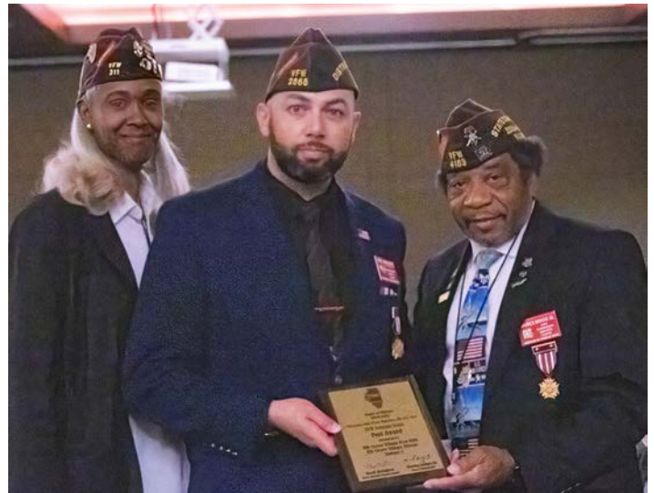
Elk Grove Village Post 9284, District 4 ($3,650)