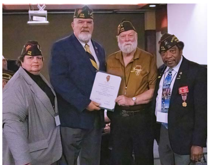
1st Place Post Publications (1-4 times) Chatham Auburn Post 4763, Chatham