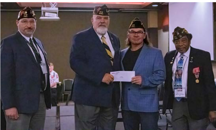
Category 3: Russell E. Dunham Memorial Post 1308, District 12