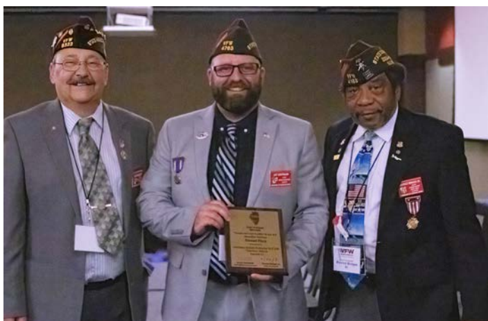
2nd Place: Chatham-Auburn Memorial Post 4763, District 10