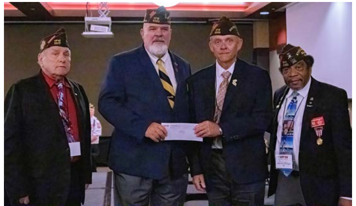
Category 2: Ambraw Post 2244, District 13