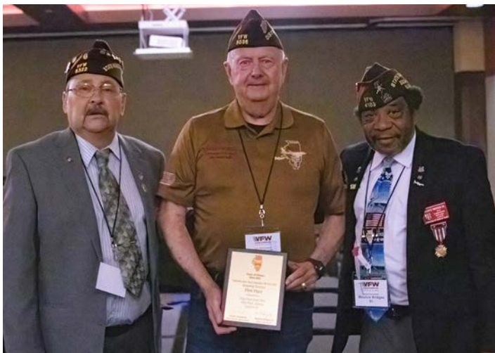
1st Place: Villa Park Post 2801, District 19