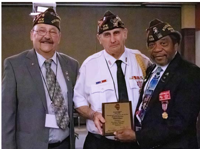
3rd Place: Fox River Post 4600, District 5