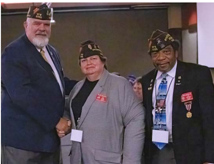
1st Place National Publications, 1-4 times per year Illinois VFW News and 3rd Place Feature Story