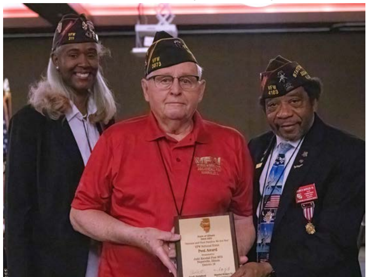
Judd Kendall Post 3873, District 19 ($30,221)