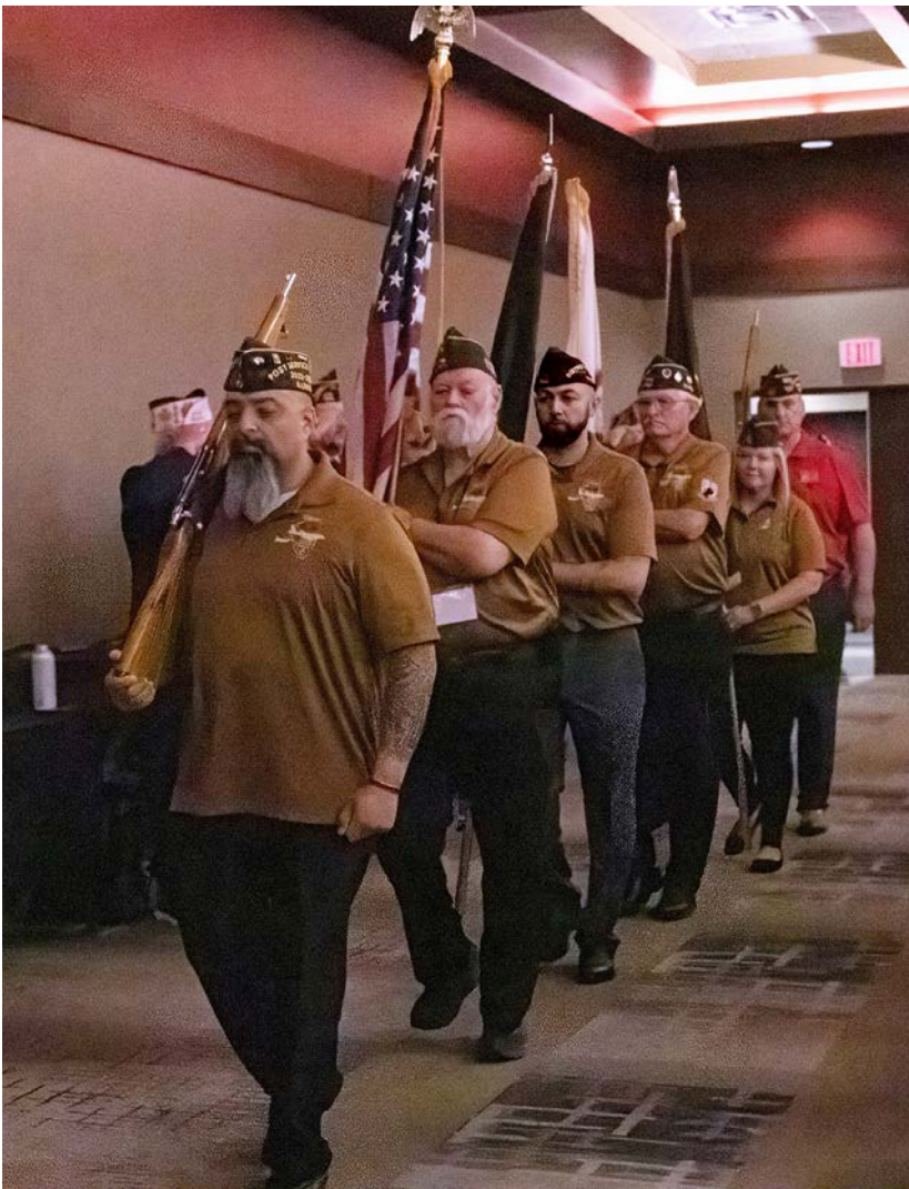
The Color Guard from Chatham Auburn Post 4763 posting the colors.