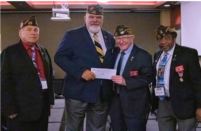
Category 3: Judd Kendall Post 3873, District 19