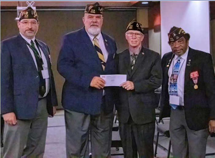
Category 1: Arnold-Heath Memorial Post 5151, District 4