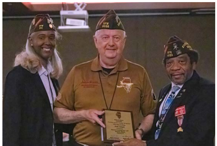
Batavia Overseas Post 1197, District 19 ($10,000)