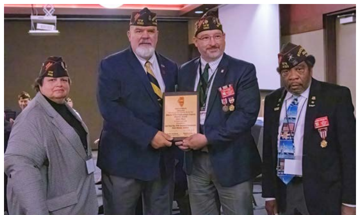
1st Place District Publications District 6