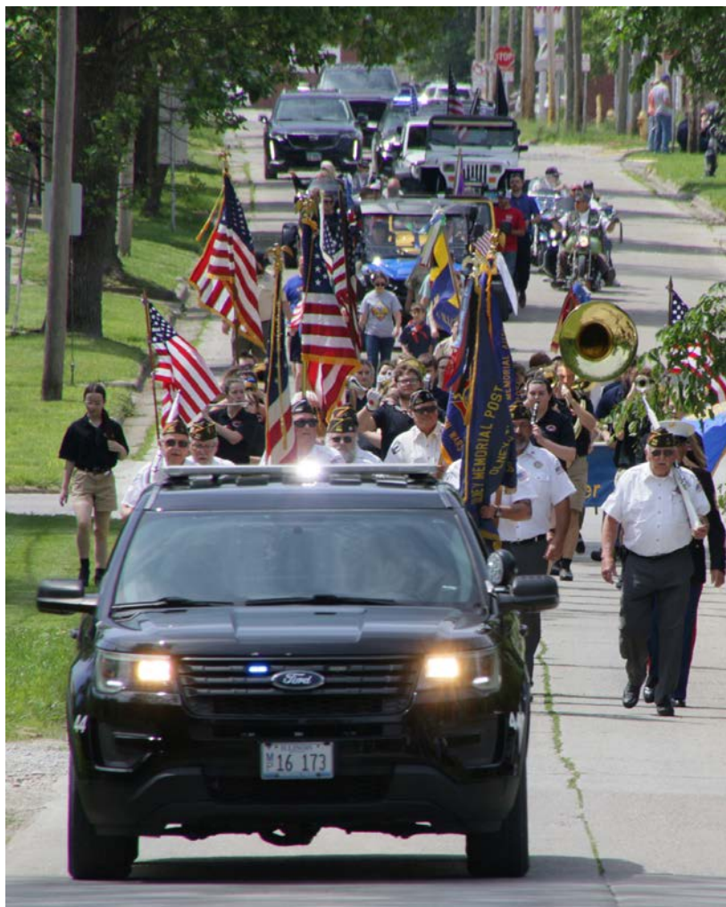
The Memorial Day procession to Haven Hill Cemetery.