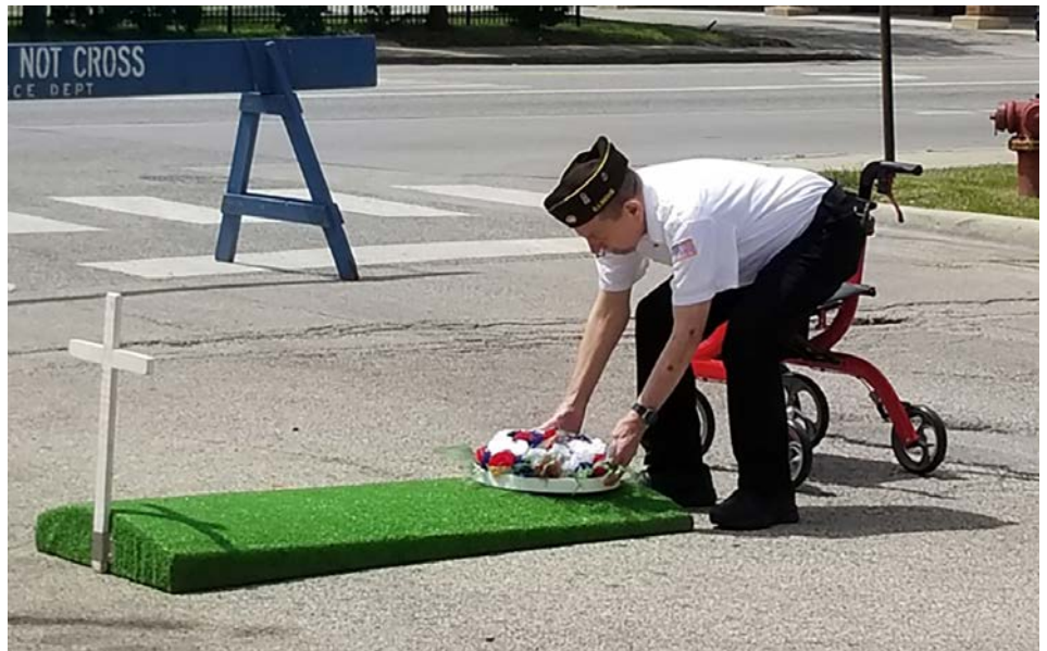
A Wreath is placed during Rhine Post 2729's Memorial Day ceremony in Chicago.

Our neighboring community looks forward to participating in our annual Memorial Day Service.