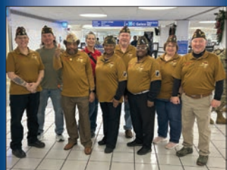
Assisting the USO