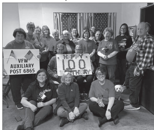
Post 6865 Auxiliary