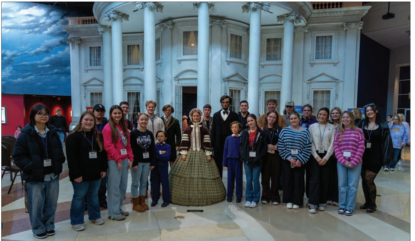
The Voice of Democracy and Patriot's Pen students were able to take a photo in front of the White House located at the Abraham Lincoln Presidential Museum and Library.