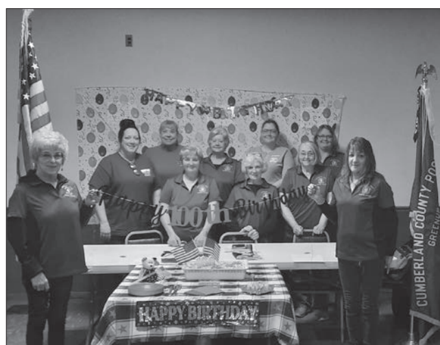
Post 4598 Auxiliary