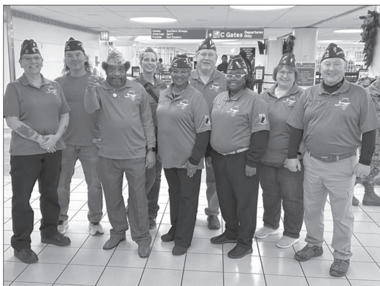
Illinois VFW Members from Districts 12 and 14 support the USO at Lambert International Airport as thousands of troops passed through the airport during holiday block leave.