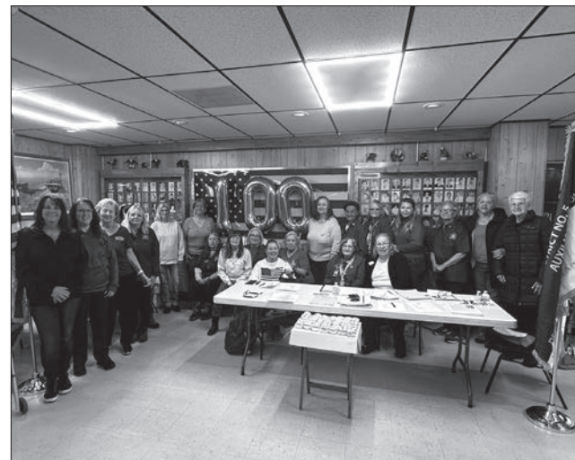
District 5 Auxiliary