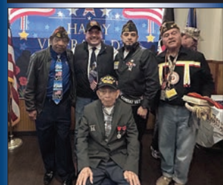
Honoring a 101-year-old veteran