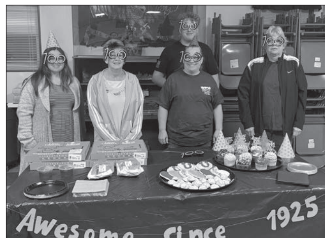
Post 7678 Auxiliary