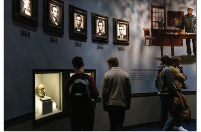
The Voice of Democracy and Patriot's Pen students toured the Abraham Lincoln Presidential Museum and Library during the weekend events.