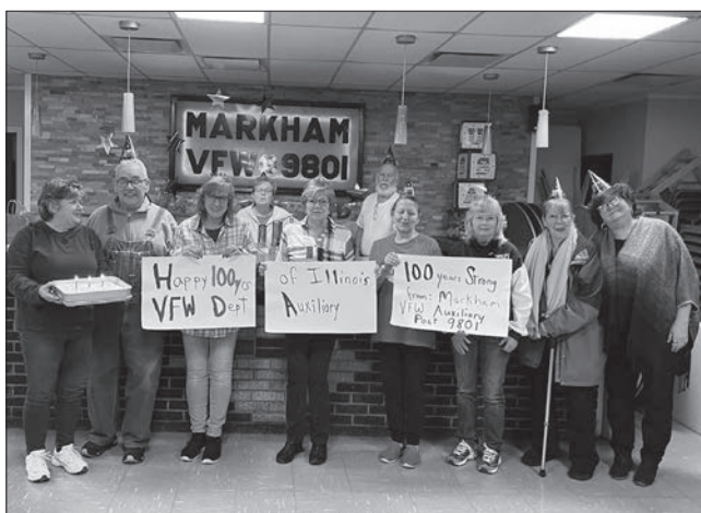
Post 9801 Auxiliary