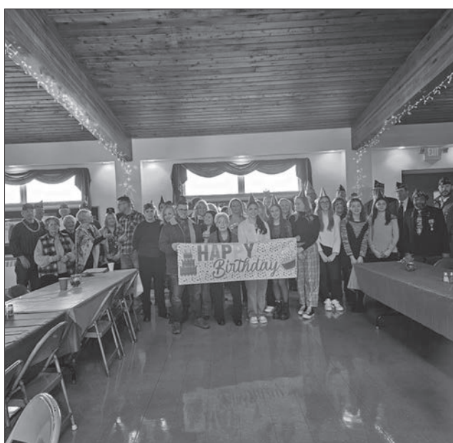
District 8 Auxiliary