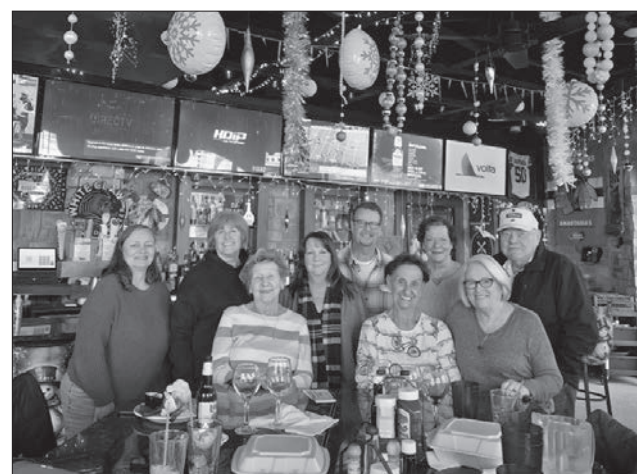
Post 4308 Auxiliary