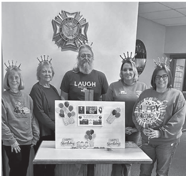
Post 4549 Auxiliary