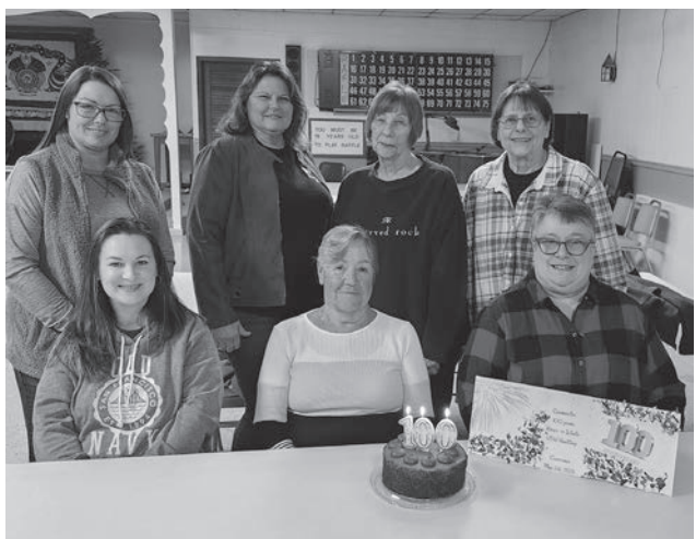
Post 5222 Auxiliary