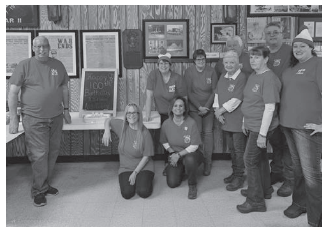
Post 4226 Auxiliary