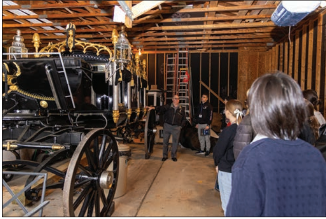
The Voice of Democracy and Patriot's Pen students viewed the Abraham Lincoln hearse during the weekend events.