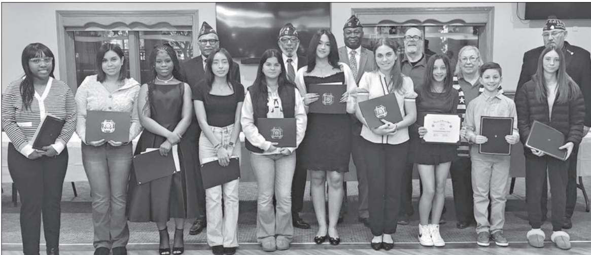
District 16 Voice of Democracy and Patriot's Pen program participants with District 16 leadership and Department representatives. The District 16 program champions were announced at a recent banquet.