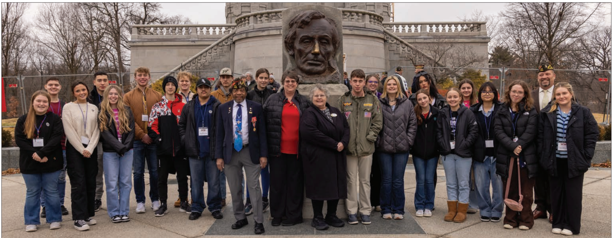
The District Voice of Democracy champions and four state Patriot's Pen finalists join state and national VFW and Auxiliary leaders for the annual Eulogy to Abraham Lincoln at Lincoln's Tomb at Oak Ridge Cemetery Feb. 8. Lincoln's Tomb was one of the Lincoln sites during the students' visit to Springfield Feb. 7-9.