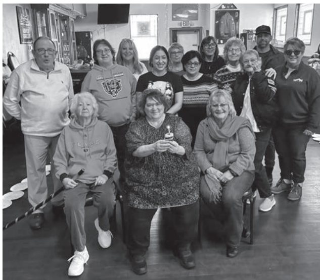
Post 5079 Auxiliary