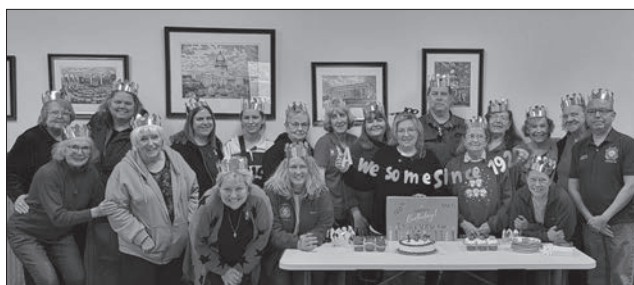
District 18 Auxiliary