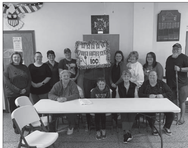
Post 7682 Auxiliary