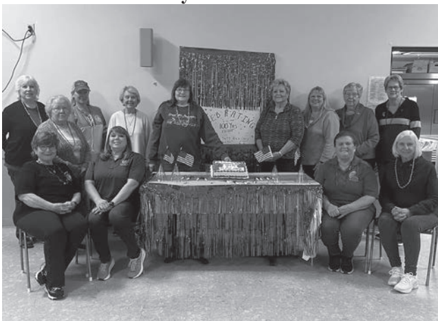
Post 5694 Auxiliary