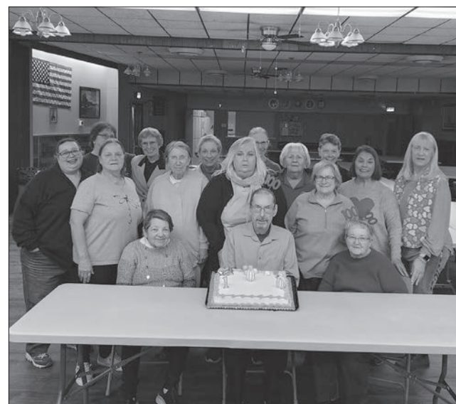
Post 2729 Auxiliary