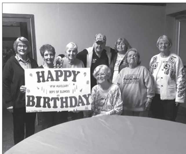
Post 1308 Auxiliary