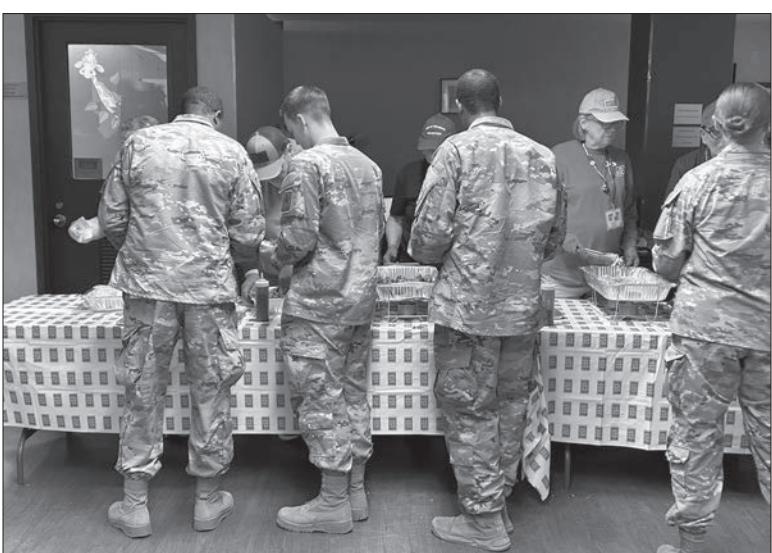
Soldiers take advantage of the USO as they travel through Lambert Airport in St. Louis for holiday leave.