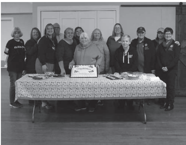
Post 5788 Auxiliary