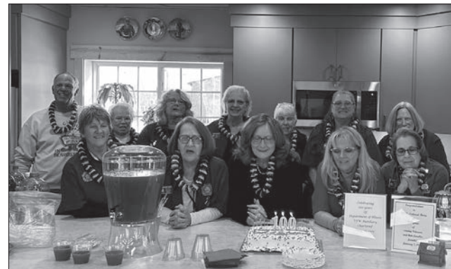
District 10 Auxiliary