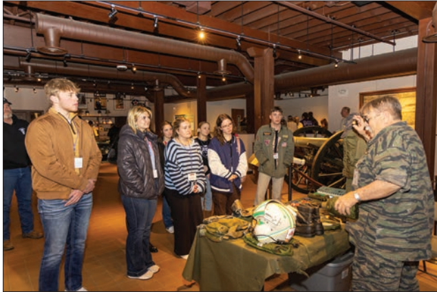
The Voice of Democracy and Patriot's Pen students toured the Illinois State Military Museum.