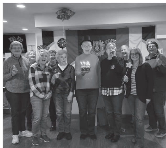
Post 6632 Auxiliary