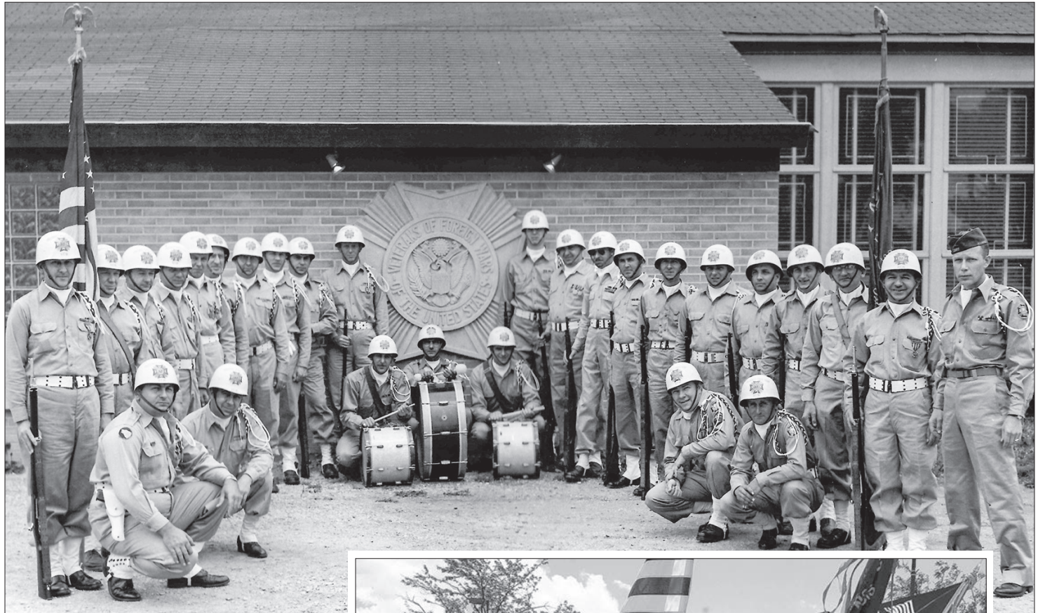
Mt. Prospect Post 1337 Color Guard in 1955.

April 5 is also a very special day in the history of the American military. It will mark the 250 th anniversary of the Revolutionary War Battles of Lexington and Concord. Additionally, that date