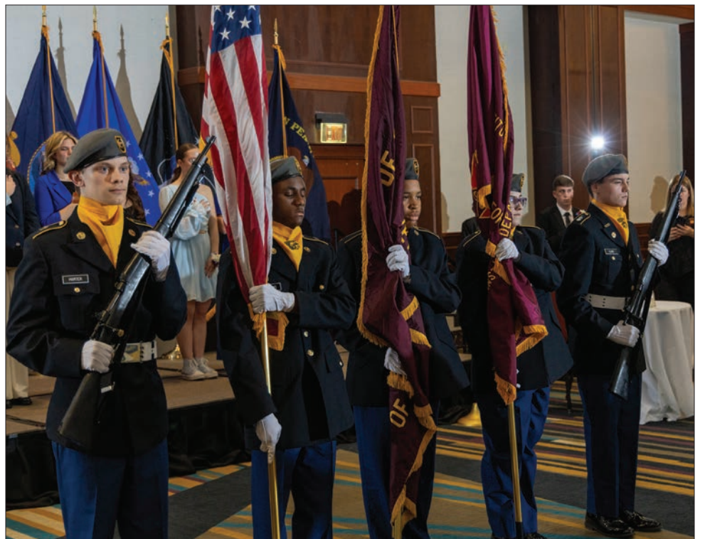
Students with the Southeast High School District 186 JROTC, Springfield, post the colors during the state banquet.