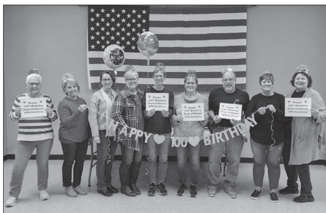
Post 1377 Auxiliary