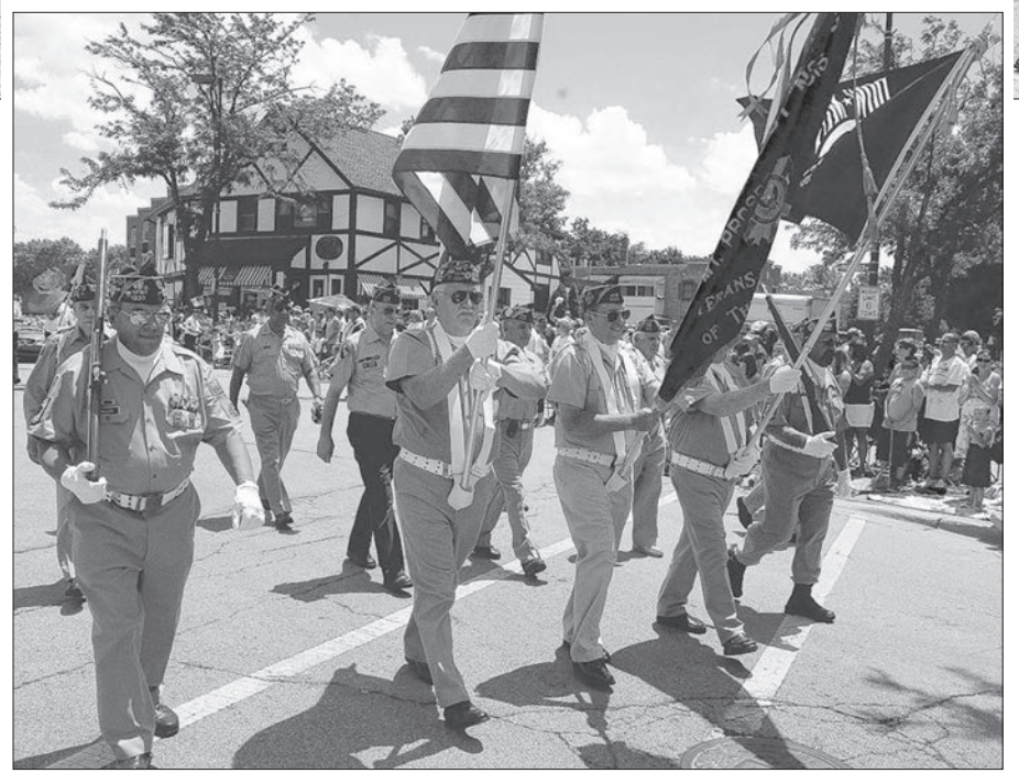
A more recent photo of Mt. Prospect Post 1337 Color Guard.

All Comrades are invited to join our local veterans and special guests at this celebration. All veteran attendees will receive a special challenge coin designed exclusively to commemorate this historic event. If interested, please go to www.vfw1337.com (under programs) for registration and other information. The Comrades of Post 1337 are especially proud to extend this offer to the residents of Mount Prospect, our hometown. Please mark your calendars for this exciting event. You don't want to miss it!