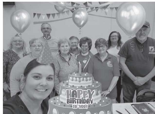
Post 3553 Auxiliary