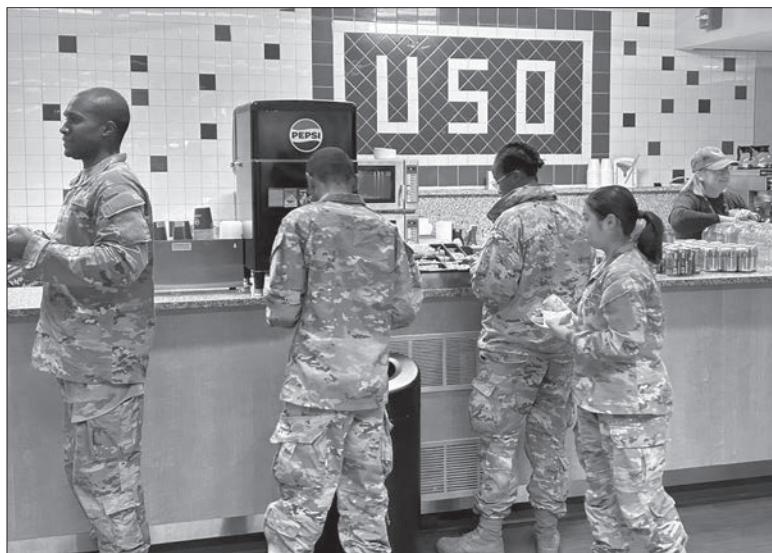
Soldiers take advantage of the USO as they travel through Lambert Airport in St. Louis for holiday leave.