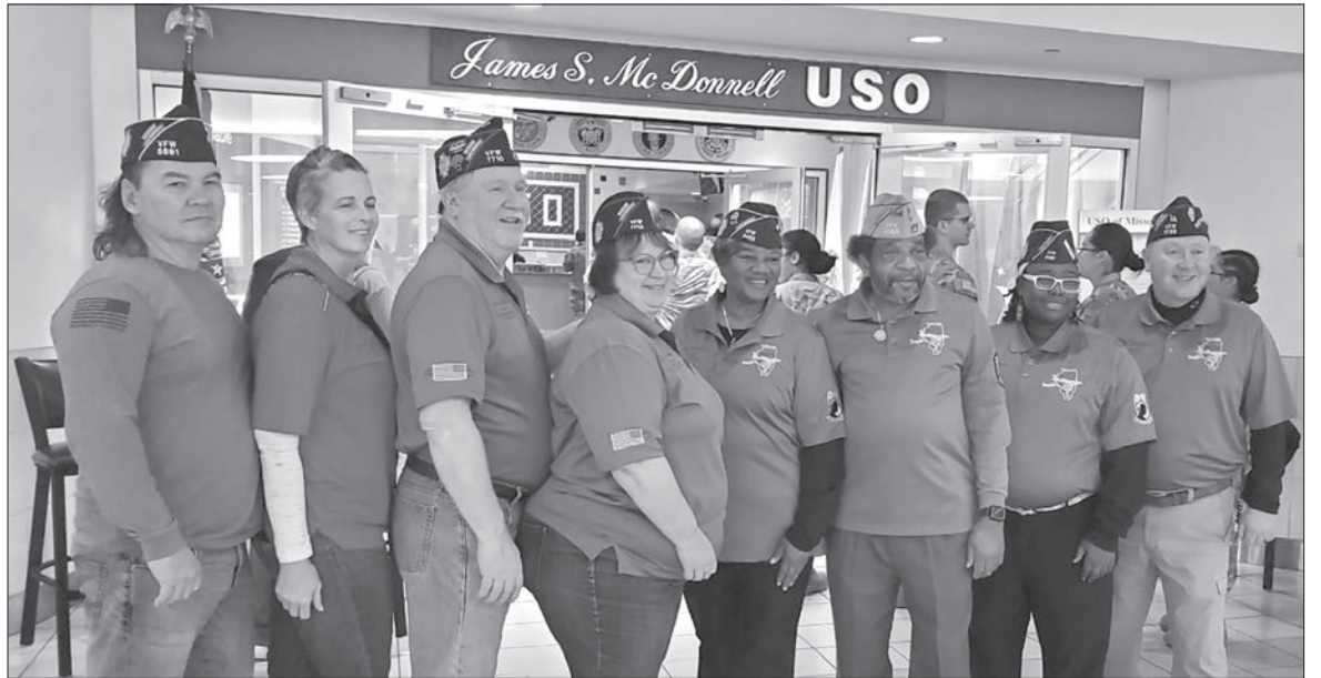
Illinois VFW Members from Districts 12 and 14 support the USO at Lambert International Airport as thousands of troops passed through the airport during holiday block leave.

For the young soldiers passing through, the kindness and assistance from these VFW members served as a heartfelt welcome as they began their journeys home for the holidays.