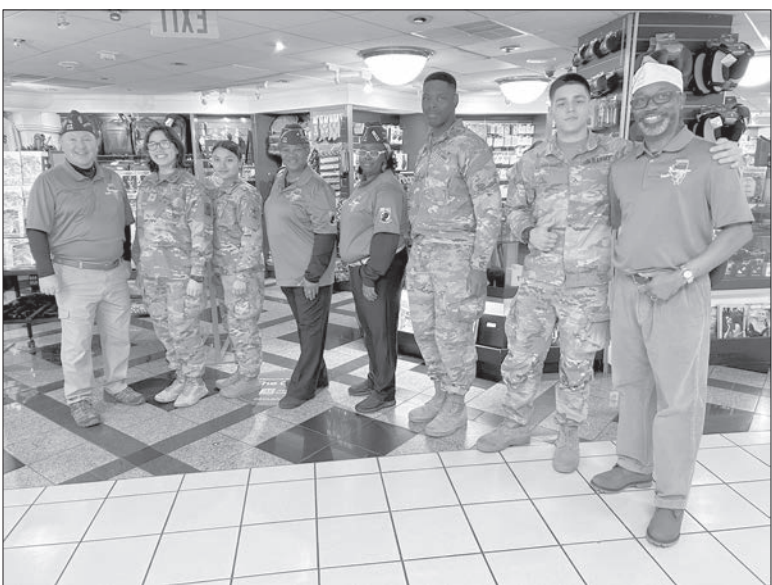
Illinois VFW members with Soldiers traveling through Lambert Airport on their way home on holiday leave.