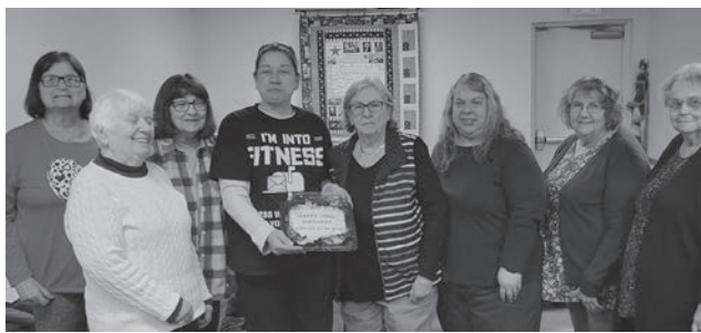
Post 4325 Auxiliary