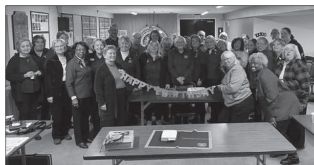
District 19 Auxiliary