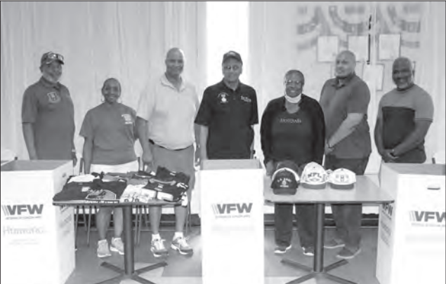
Benjamin O. Davis Post 311, Richton Park, participated in a clothing drive May 14 as part of the Veterans of Foreign Wars Day of Service. The clothing was delivered to Featherfist, Chicago’s largest homeless outreach nonprofit agency.