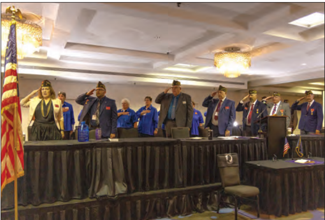
The joint opening ceremony for the State Convention are conducted in Springfield.