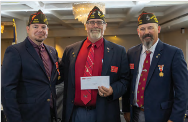
District Americanism Award District 18