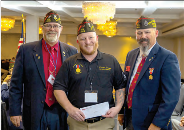
Blood Donor Post Award to Post 1377, District 12.