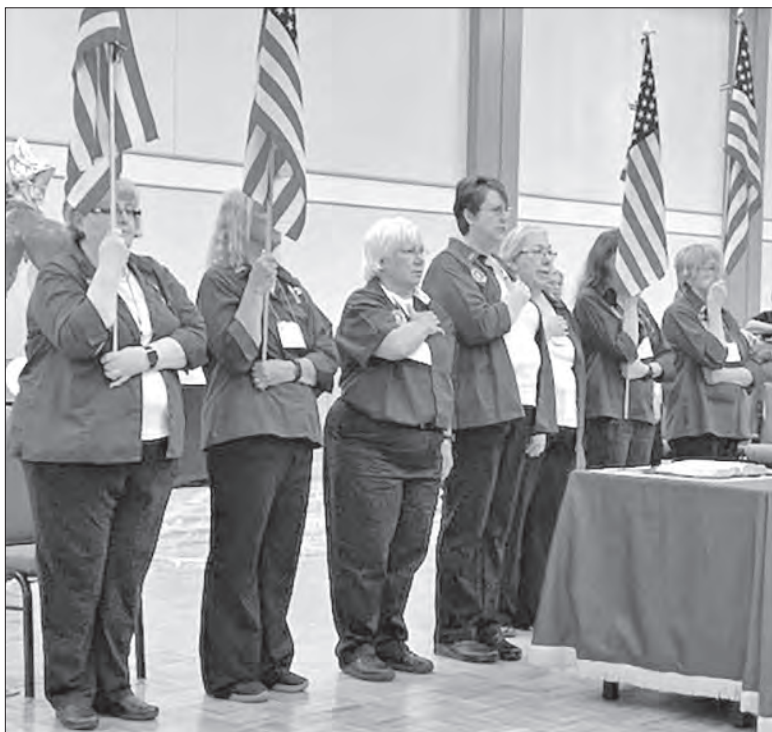
The Department Auxiliary's Color Team at the altar during the Auxiliary's State Convention in Springfield.