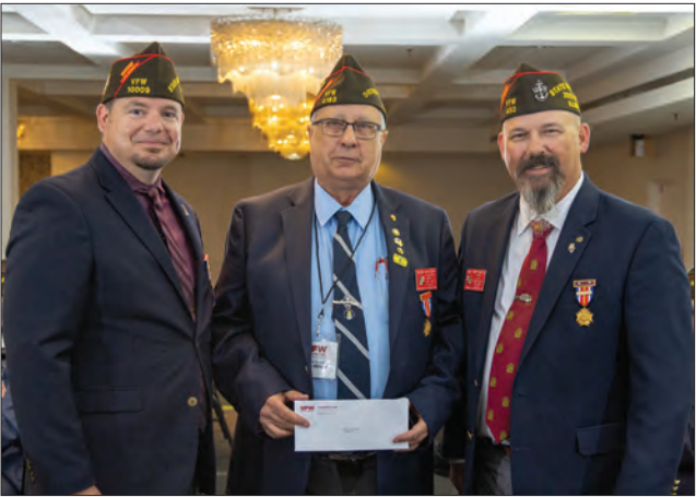
District Americanism Award District 14