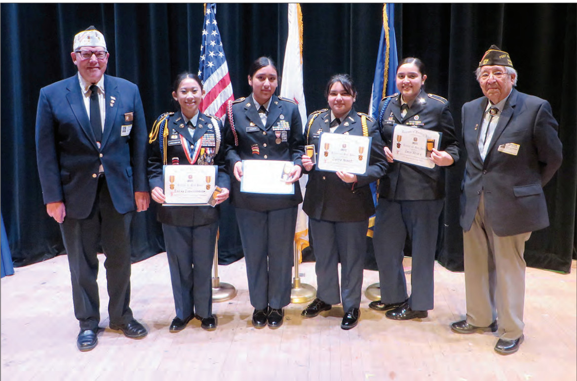
Cantigny Post 367 presents JROTC awards to Joliet students