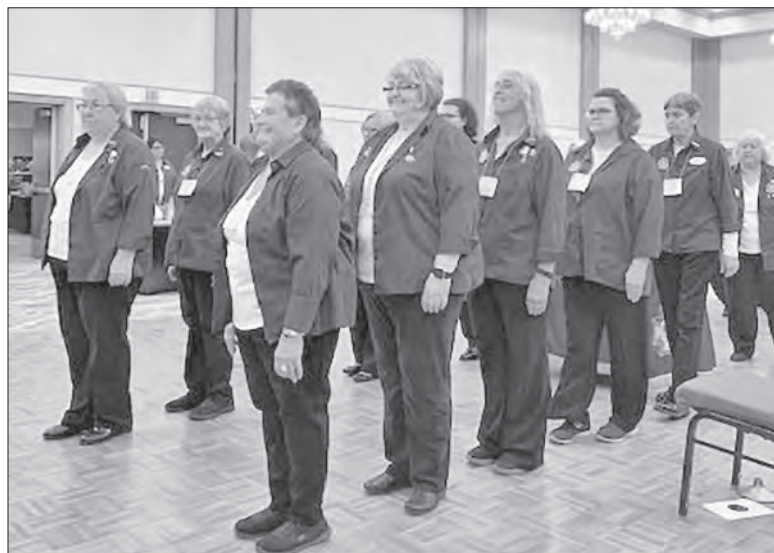
The Department of Illinois Auxiliary's Color Team performs the Cross of Malta during the Auxiliary's State Convention in Springfield, Illinois.