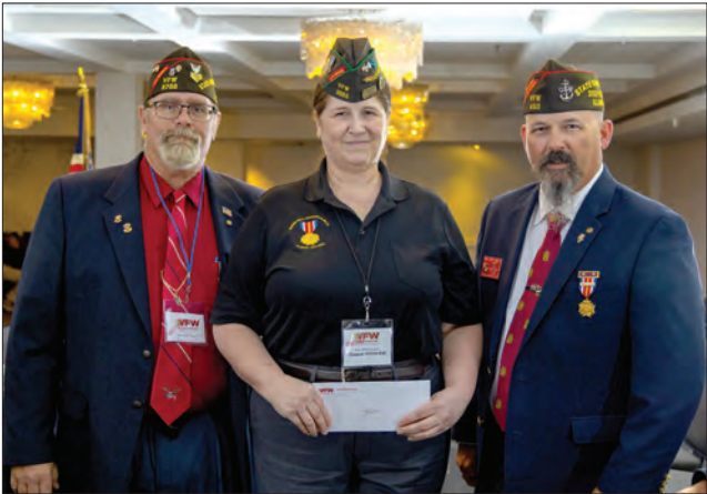
Blood Donor Post Award to Post 2244, District 13.