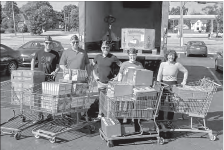
Post 1461 VFW and auxiliary members in front of the donation.

On a bright Saturday morning, 5 members of the VFW and 1 member of the VFW Auxiliary showed up to Aldi before they opened and met up with the driver for Empower Boone. When the store opened, we went in to pay for the donation. $550 later we walked out with 630 lbs. of food in 4 grocery carts. We loaded the truck, providing the 1,220 meals.