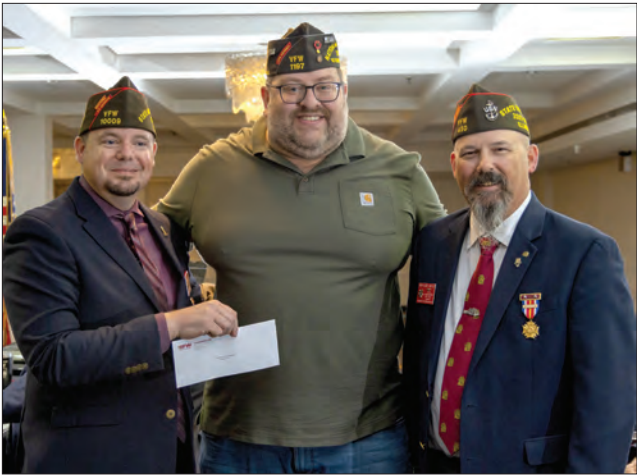
District Americanism Award District 19