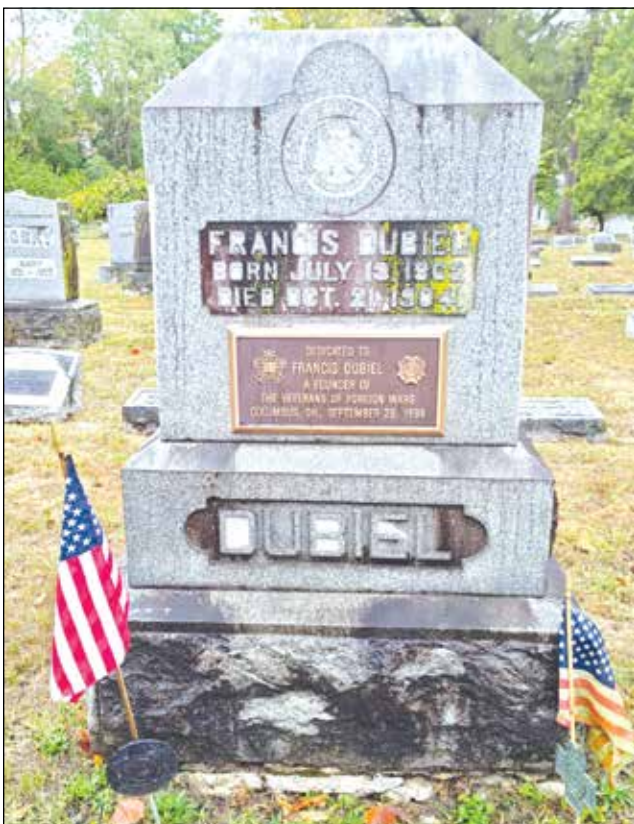
The gravesite of Francis Dubiel at Greenlawn Cemetery in Ohio.