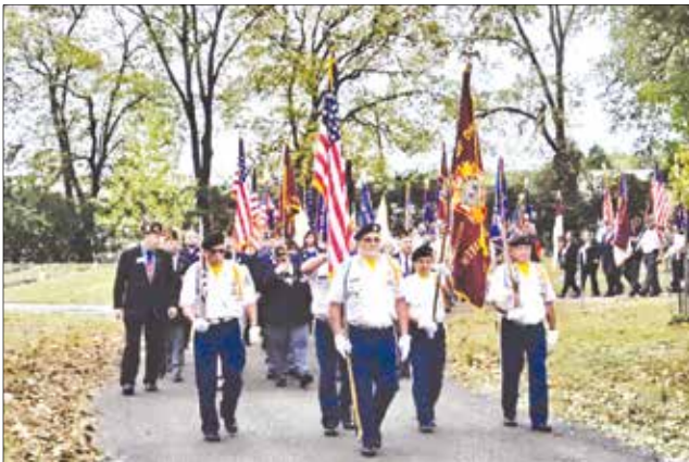
Veterans from the Department of Ohio march into the cemetery to honor the founders of the American Veterans of Foreign Service during Founders Day.